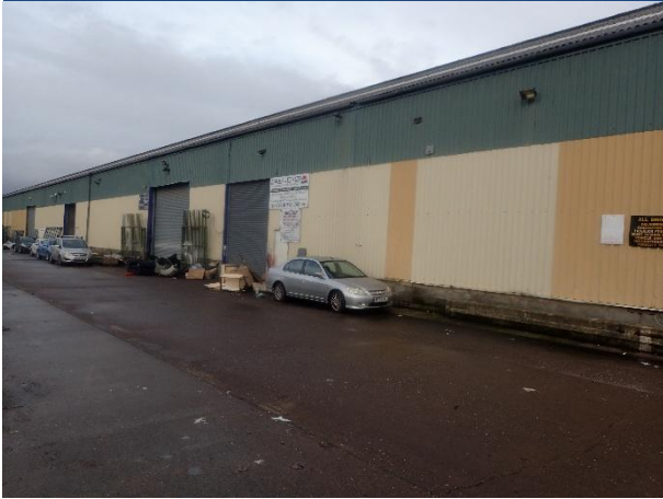
Units E2 & E3